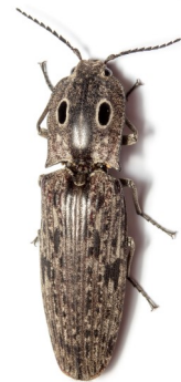
Eyed click beetles ( Alaus sp.)

To report a suspected Asian longhorned beetle please take a photo and email it to badbug@ncagr.gov and include a size reference, like a coin, if possible.