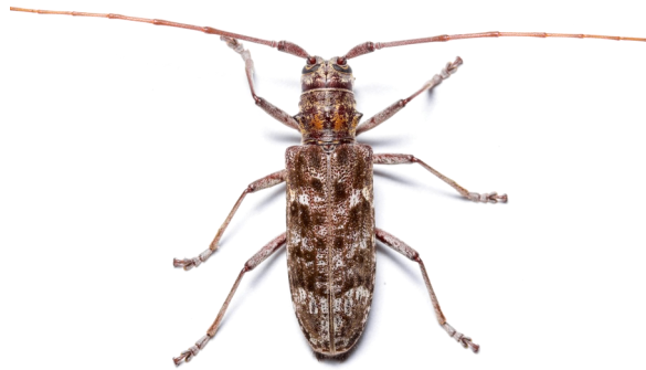
Pine sawyers ( Monochamus sp.)

BELOW ARE INSECTS COMMONLY MISTAKEN FOR ASIAN LONGHORNED BEETLE IN NORTH CAROLINA: