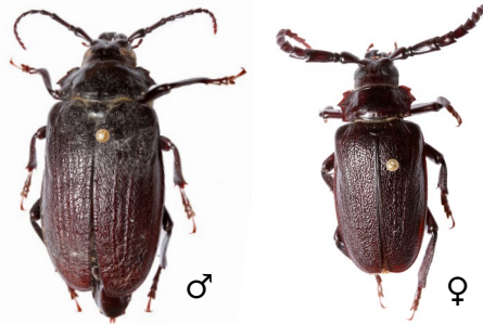
Broad-necked root borer ( Prionis laticollis )