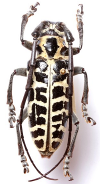
Cottonwood borer ( Plectrodera scalator )